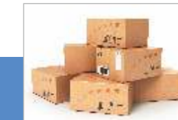
Parcel and Courier