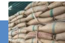
Food Grain Bags