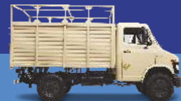
LARGER LOADING AREA