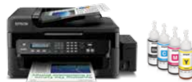
Ink Tank System Printer L550

With optional Wi-Fi connectivity and up to 3,000 lumens of white and colour brightness, this compact business projector delivers brilliant presentations.