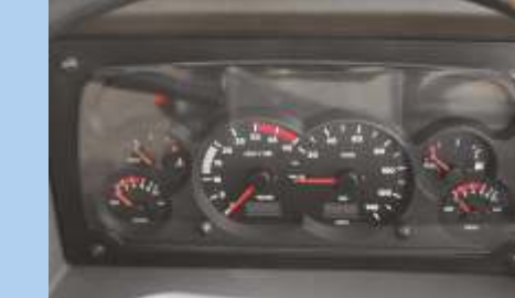
Ergonomic Dashboard Design