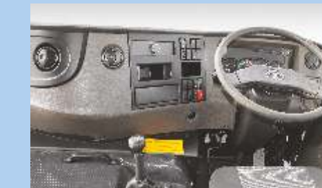
Ergonomic Steering Wheel