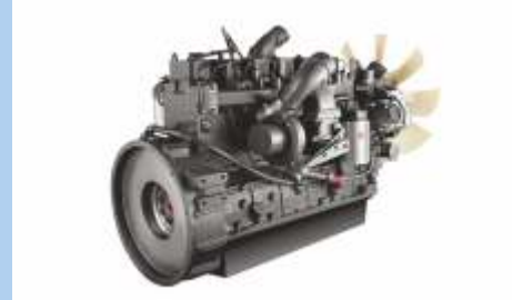
Fuel Efficiency Technologies for Better Fuel Mileage