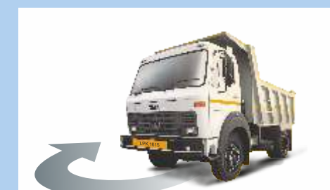
Low Turning Circle Dia