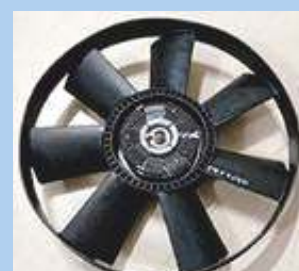
Electronic viscous fan