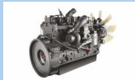
Reliable Cummins Engine