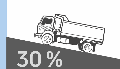
30 % Max. Climbing Ability