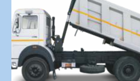
Reliable Tipping System