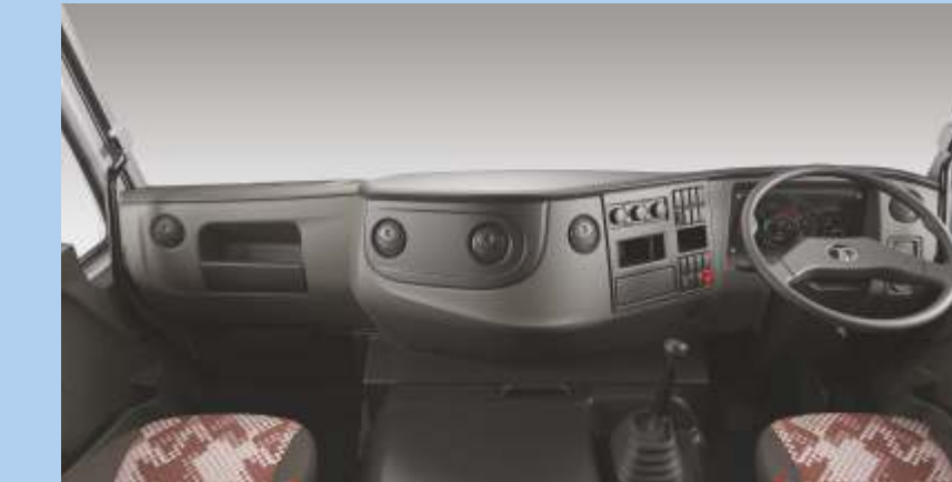
Easy accessibility of controls, comfy and expedient driveability