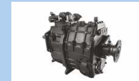
G600 Gearbox: Improved Gear Ratios for Better Mileage