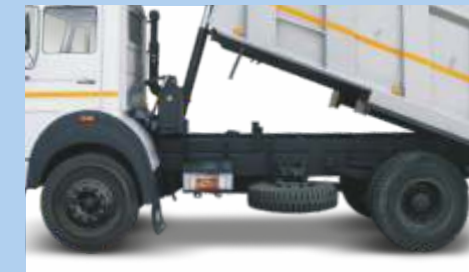
Options of Wheelbase and Length for Varied Applications