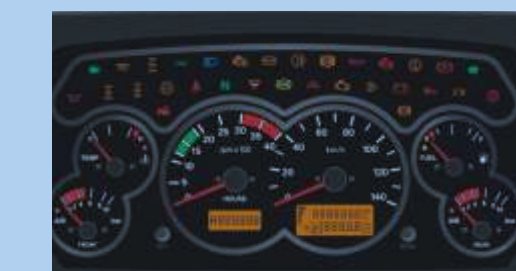
Ergonomic dashboard design with advanced Instrument Cluster and Tell Tale Lamps