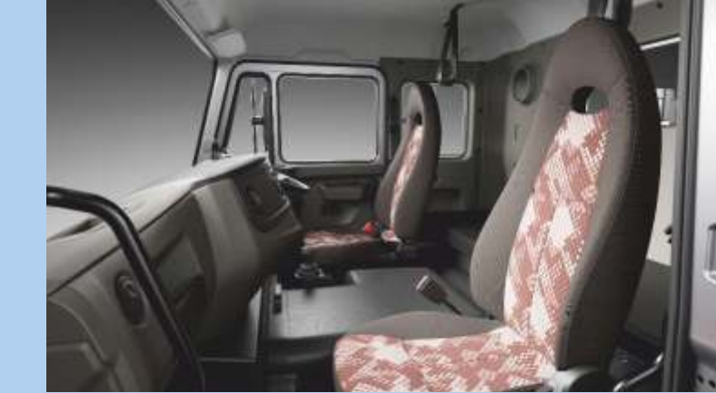
Premium interior aesthetics for superior in-cab driving experience