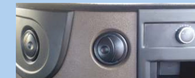
Truck ventilation system