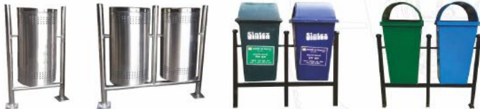
CODE : QEE SB BIN (Capacity 10 Ltr.)