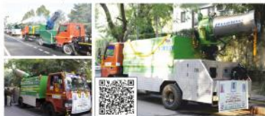
The anti-smog gun is fed by a 5,000-litre water tank and can work for 3-4 hours continuously.

It is mounted on a BS-VI emission standards engine truck which causes lesser vehicular pollution, said a government statement.