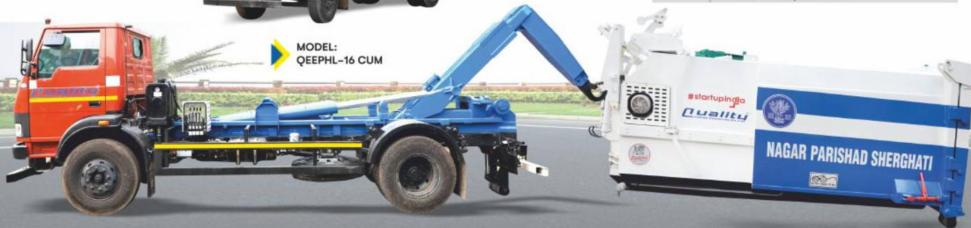
▶ MODEL: QEEPHL-16 CUM