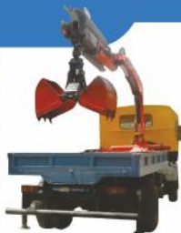
QEESCOOP - 200LC