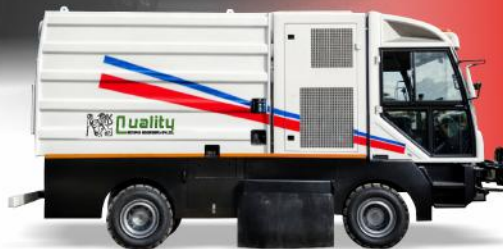
QEEESP- 3 CUM

Road Sweeping Machine: The introduction of these machines has revolutionized the road construction industry and simplified the innumerable tasks that earlier needed many road sweepers to complete the needed work. These are highly specialized and efficient machines, which have a huge market demand and therefore have a great relevance in the industry. Their container capacity ranges from 2000Ltrs up to 5500 Ltrs.