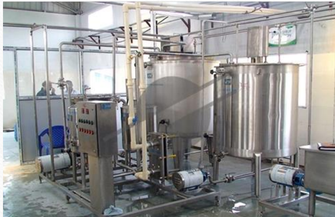
Sugar syrup preparation Tanks