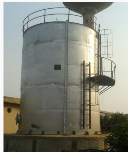
Base oil storage tank