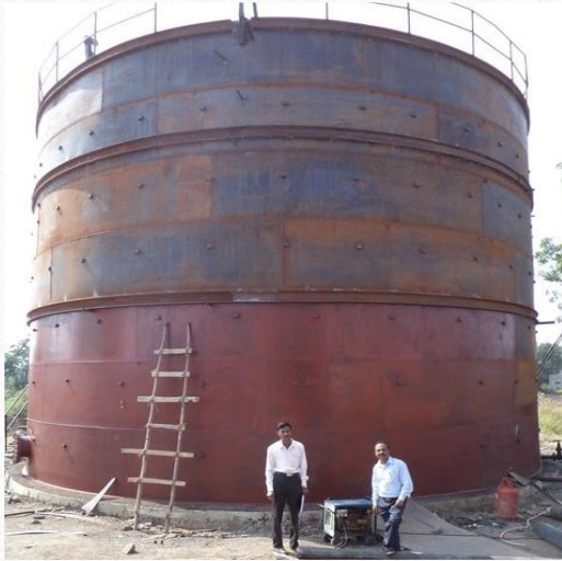
Molasses sugar tank