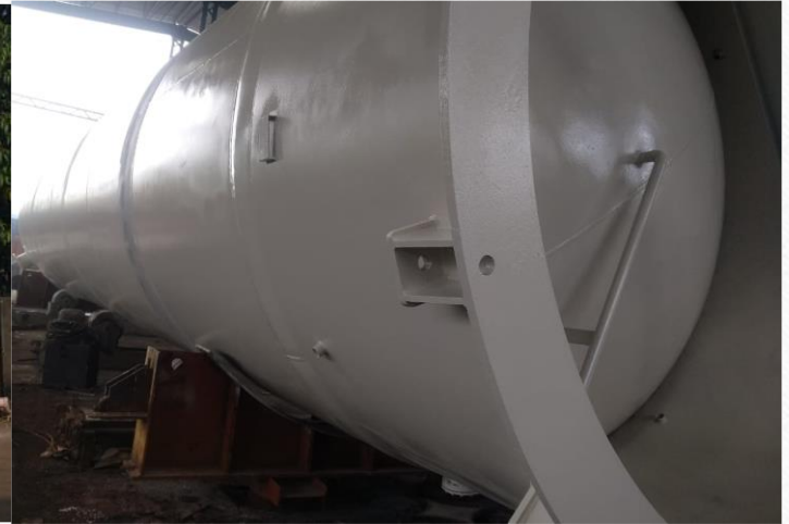
Nitrogen Storage tank