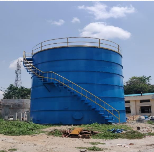
Fish oil storage tank