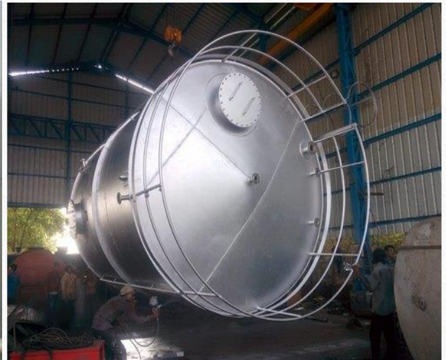
Furnace Oil storage tank