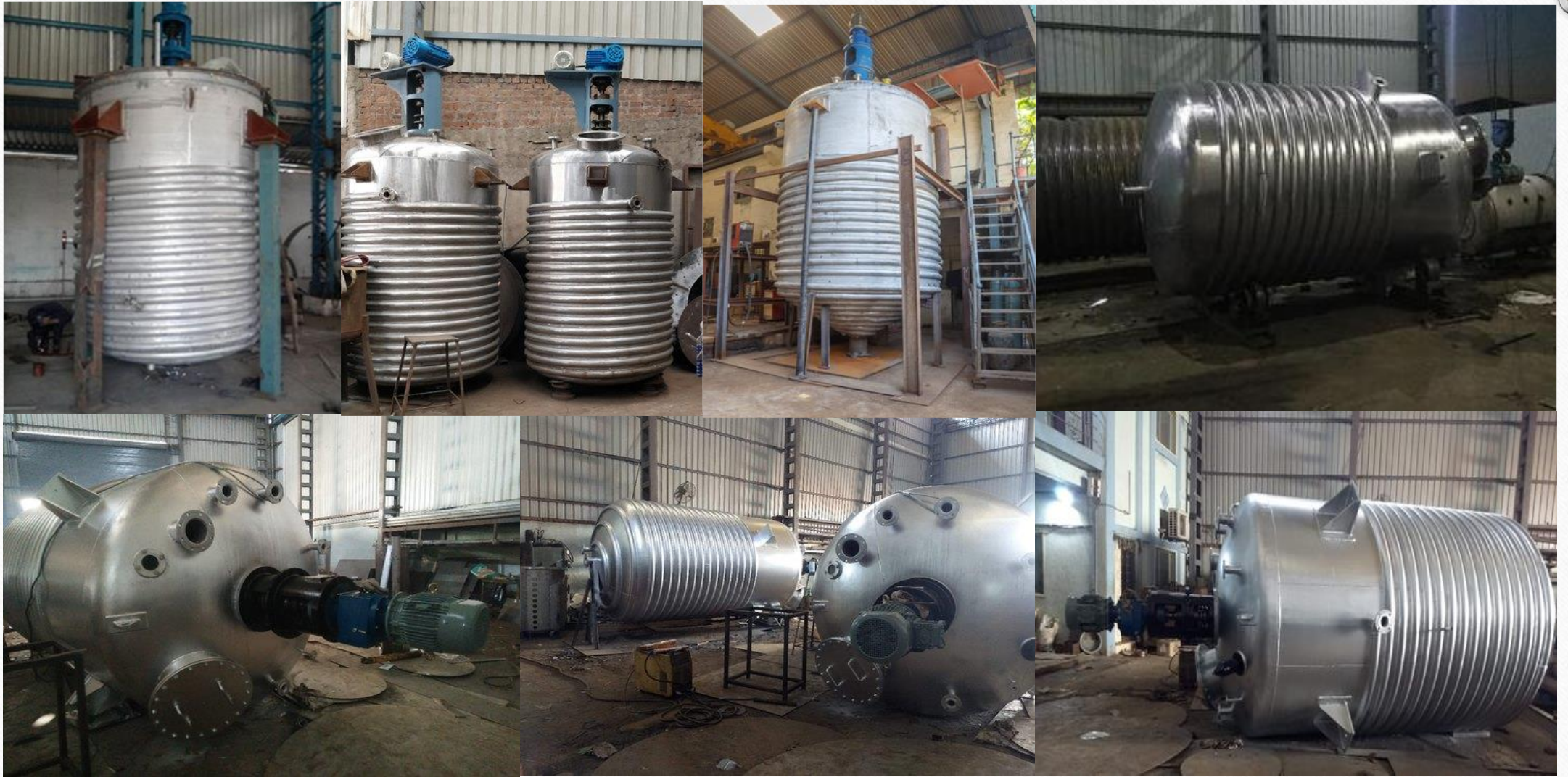
Stainless steel limped coil Chemical Agitator/Reactor/Mixture for chemical & oil industries.