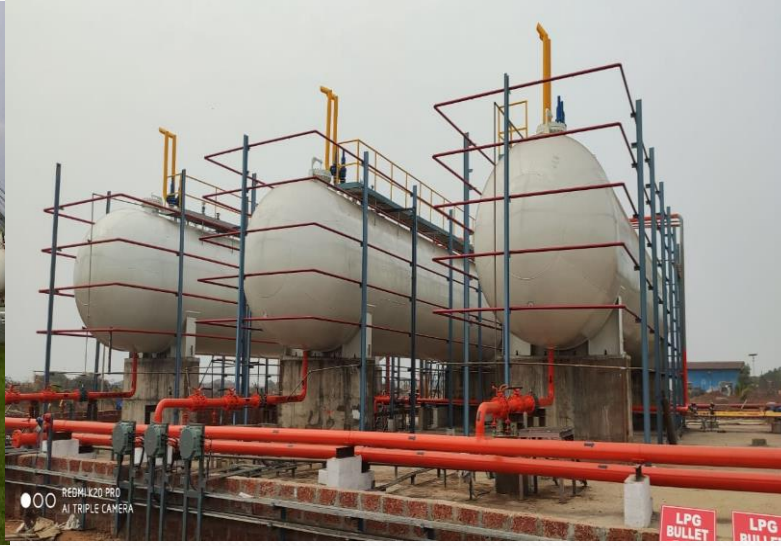
Propane Storage Tank