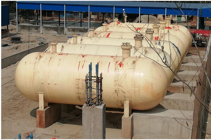
LPG mounded Storage Tank