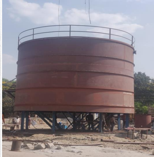
Dome roof storage tank