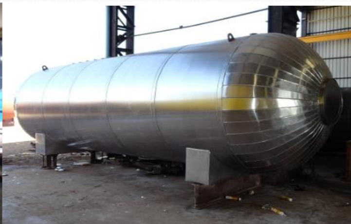
L CO2 Storage tank