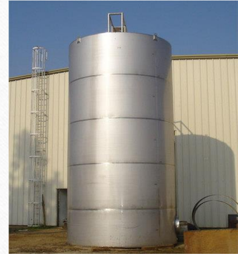
Sugar storage tank