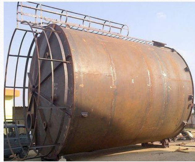
MS Oil storage tank