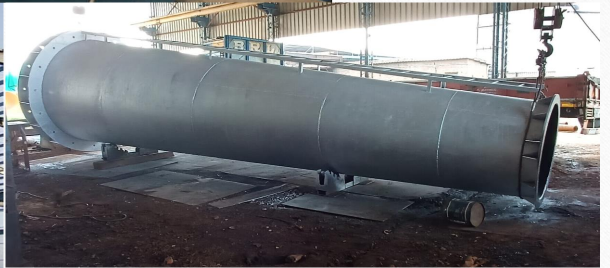
PEB Structure fabrication & Erection