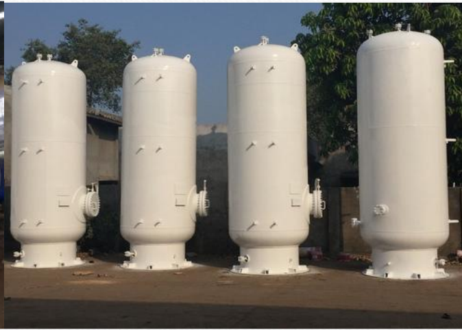
Oxygen Storage tank