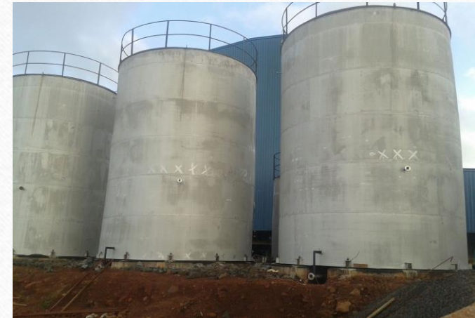
SS storage tanks