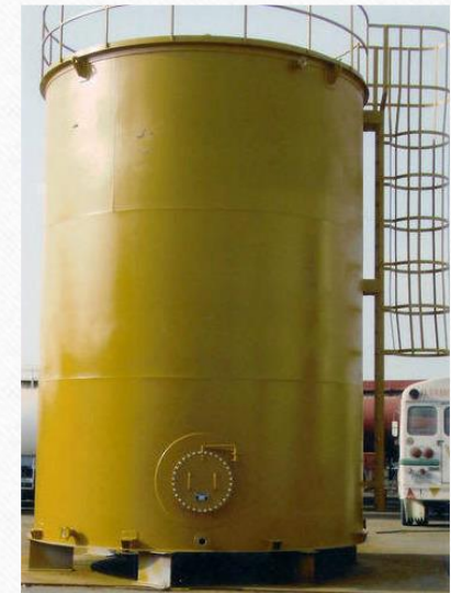
Acid storage tank