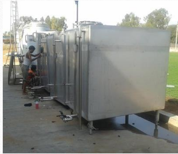
Sugar Cane Storage Tanks