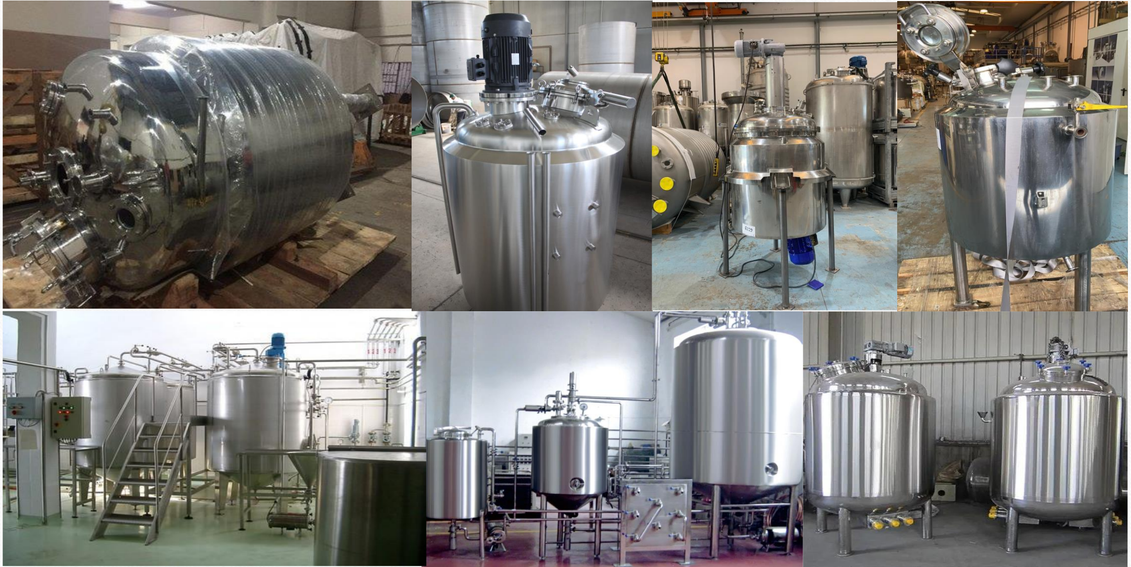
Pharmaceutical Stainless steel double limped coil with jacketed Agitator/Reactor/Mixture.