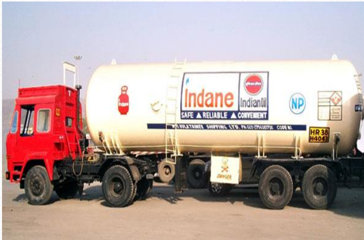
LPG transportation/road tanker