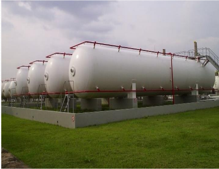
LPG Storage Tank