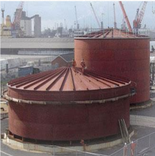
Cone roof storage tank