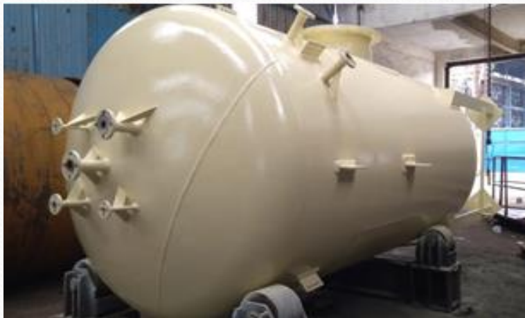
Argon Storage tank