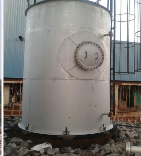
SS Oil storage tank