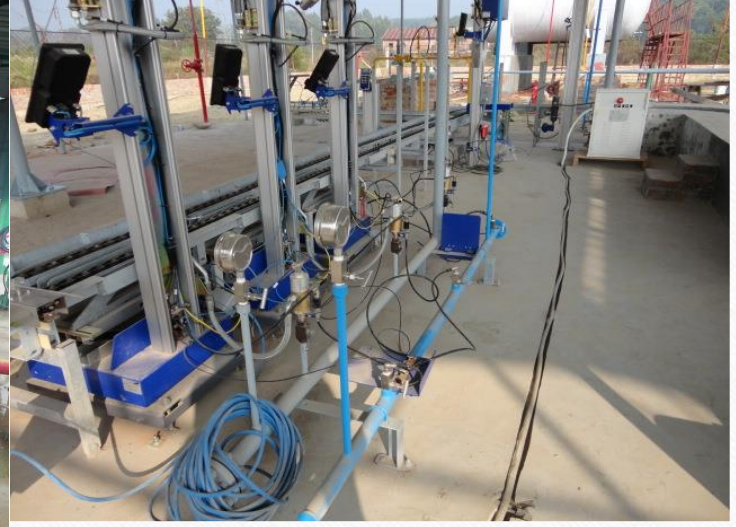
LPG Bottling plant - LPG tanks, Filling pumps, compressor, filling hall equipments, Roller/chain conveyor, pipeline etc.