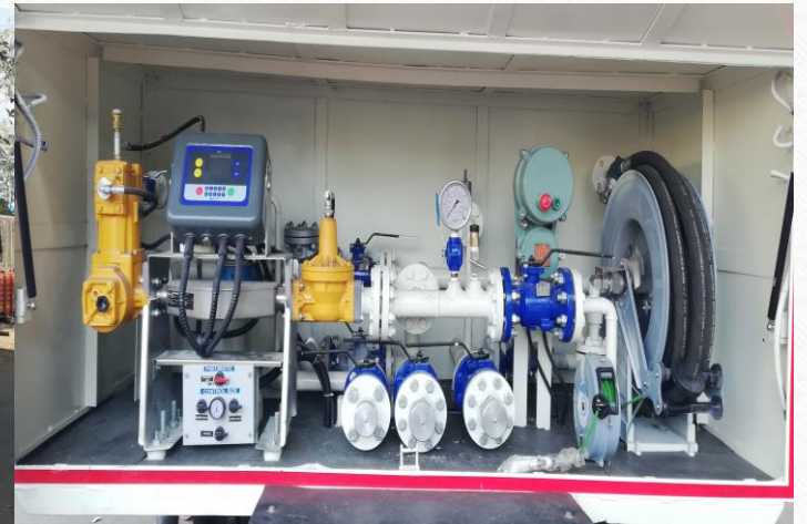
LPG Bobtail Metering system