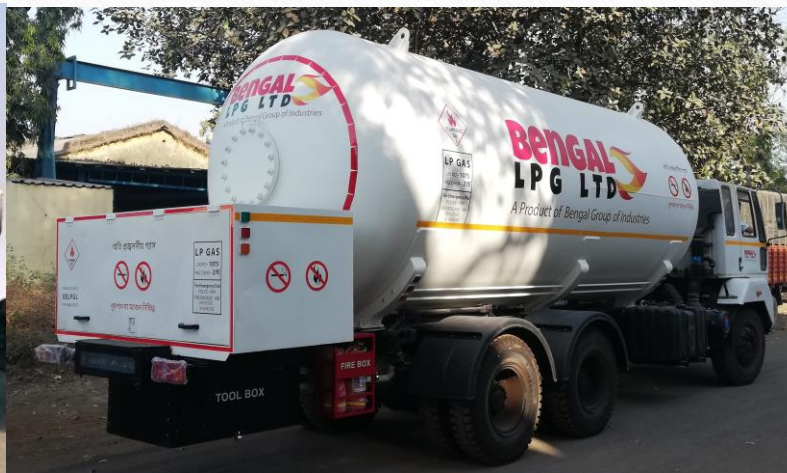
LPG Bobtail road tanker