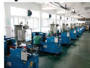
Plastic Injection Workshop