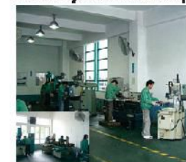
Mould Processing Workshop