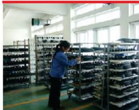
Product Agenda Room

With years of investment in quality and customer satisfaction we can very proudly claim that CRUSADERS AIR PURIFIERS are the BEST in the country and MADE FOR INDIA.