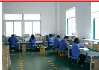
Incoming Quality Control