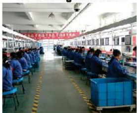
Small Product Assemble Line