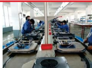
Large Products Assemble Line