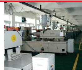
Plastic Injection Workshop