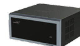
VGMW 500 PLUS