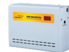
VGB 500 DIGITAL