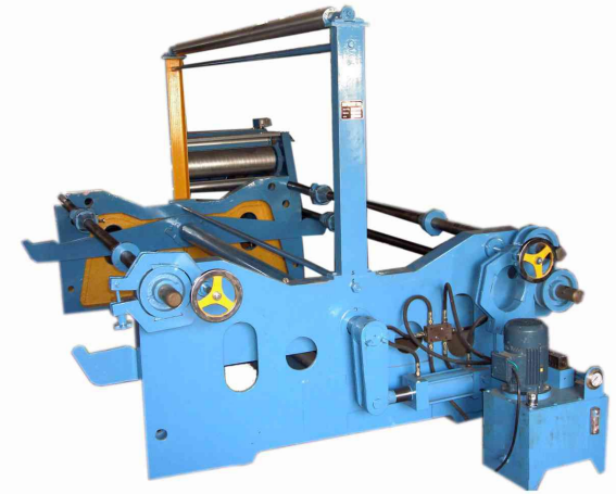
SCRL-03 HYDRAULIC 1.5 MTR