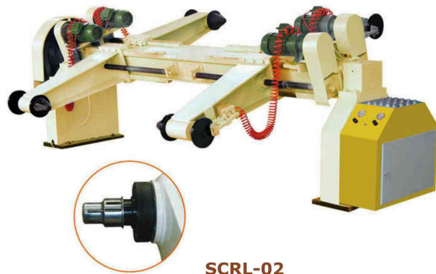
SCRL-02 ELECTRIC SHAFTLESS