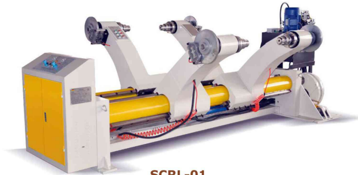
SCRL-01 HYDRAULIC SHAFTLESS

The reel loading stand are required to lift reels for Corrugator Machine.