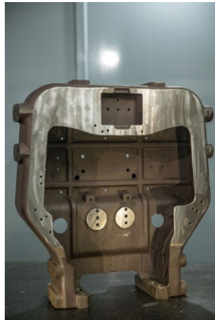
Front Axle Bracket