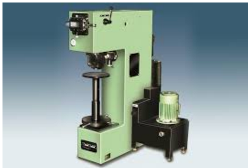
Blue Star Hardness Tester