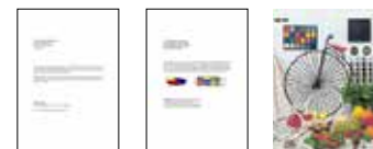
#1 Black Text #2 Black Text and graphics #3 Photo 4R (4 x 6")

1 Print speed (Pages Per Minute) is calculated when printed on A4 plain paper in the fastest mode, 10 x 15 cm photo print speed when printed on Epson Premium Glossy Photo Paper. Print speed may vary depending on system configuration, print mode, document complexity, software, type of paper used and connectivity. Print speed does not include processing time on host computer.