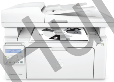
HP LaserJet Pro MFP M132snw