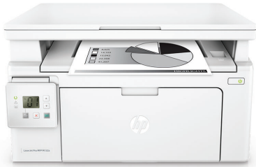
HP LaserJet Pro MFP M132a

Print professional documents from a range of mobile devices, 1 plus scan, copy, fax, and help save energy with a wireless MFP designed for efficiency.