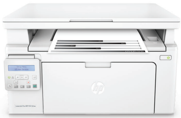
HP LaserJet Pro MFP M132nw